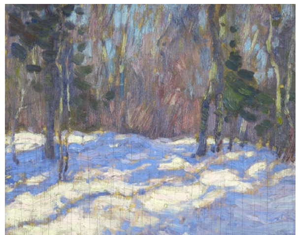
A.Y. Jackson Snow, Algonquin Park , c. 1914, MCAC

Once you've taken in the beauty of the landscapes within Algonquin park, experience A.Y. Jackson's Autumn, Algonquin Park c.1914 at the Art Gallery of Ontario, or MacDonald's Snow, Algonquin Park c. 1914 McMichael Canadian Art Collection. Both works are on display at locations which are part of the Greater Toronto Area Group of Seven Discovery Route.