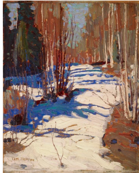
Tom Thomson Path Behind Mowat Lodge, 1917, AGO

Tom Thomson wasn't the only artist who loved Algonquin Park. The waterways and tree lined shorelines inspired Harris, MacDonald, Jackson and Lismer who also completed sketches and full finished paintings of Algonquin Park. when out on the trails.