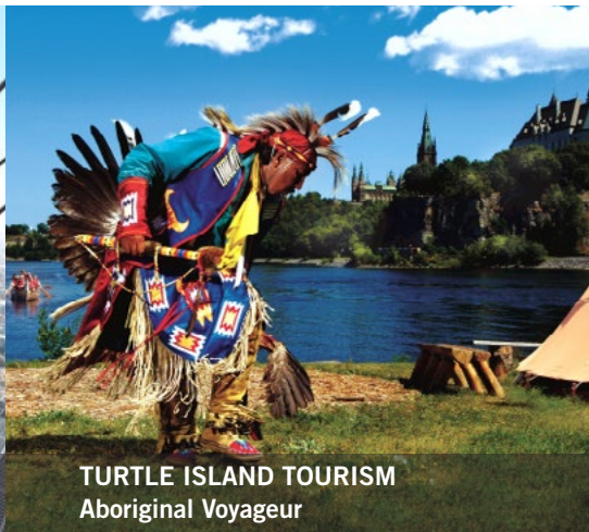
TURTLE ISLAND TOURISM Aboriginal Voyageur